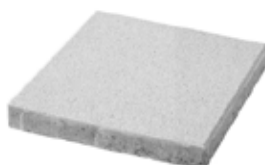
Format 2 40 x 40 cm